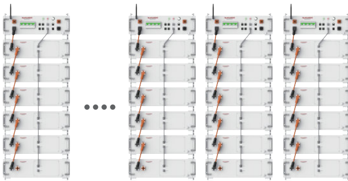
Expansion in DC side